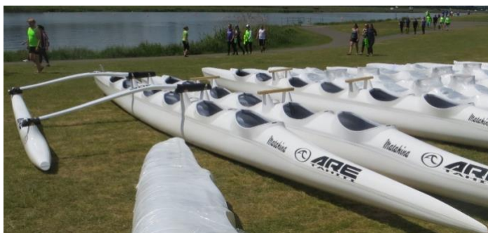
This was the boat used for the Dorney Championships

The V6 for the Distance Championships 2023 is the 'ARE Matahina' .